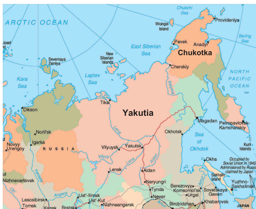
Figure 1. Map of eastern Russia (open access), showing the location of the Yakutia Republic and Chukotka Autonomous Okrug.

available in 22% of Chukotka settlements and only in 5.8% of Yakutian inhabited localities.