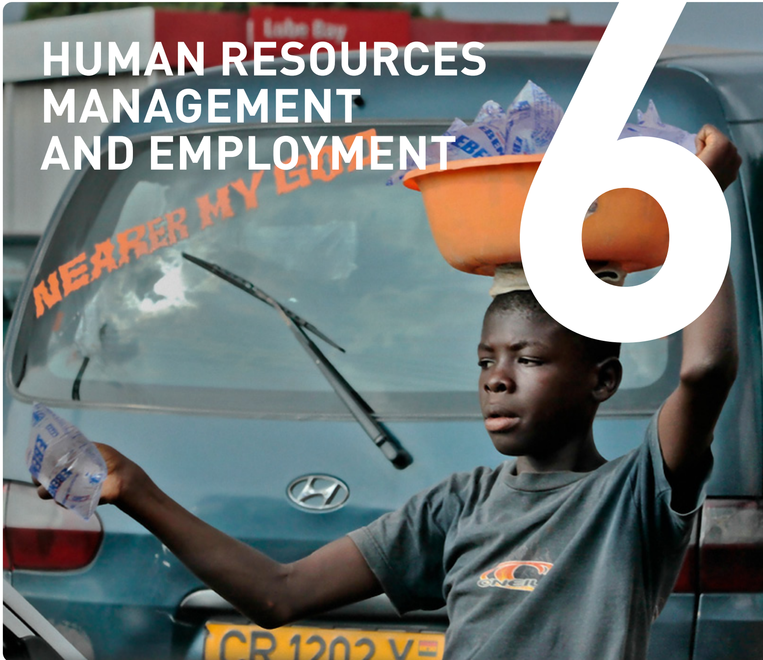
A boy sells drinking water in packets, in city of Kumasi in Ghana. The message on the back of the car adds a touch of meaning to his job.