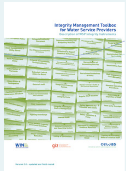
Description of Integrity Instruments