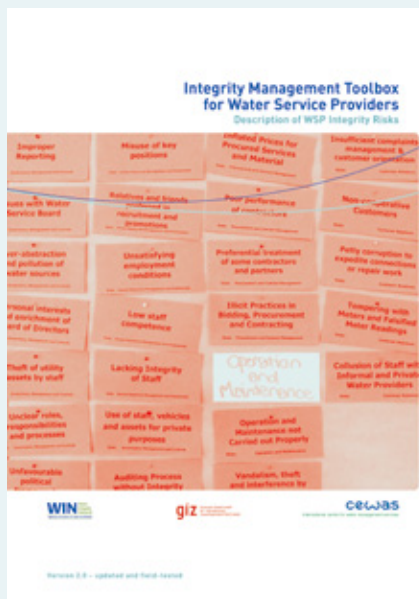
Description of Integrity Risks