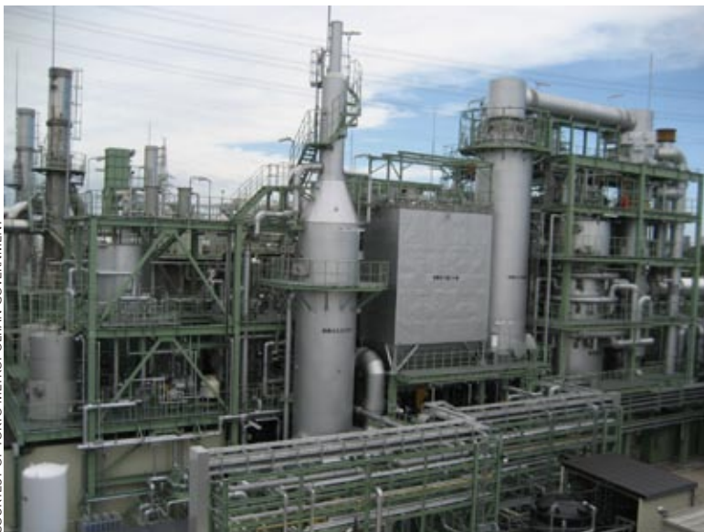
The sewage sludge gasification furnace plant at the Kiyose Water Reclamation Center, Tokyo.