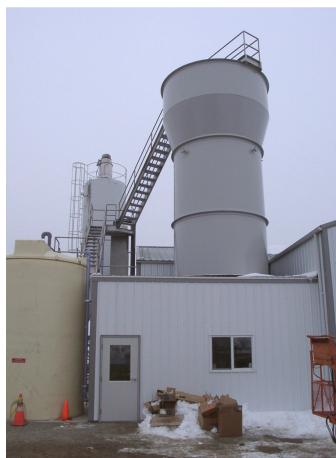
The Crystalactor ®

At Alto, the Crystalactor ® is located after the activated sludge treatment system and handles about 125 m 3 /h of wastewater with a maximum phosphorus concentration of 25 mg/L. The “pellet” reactor, 3.0 meters in diameter, is filled with quartz sand as seed material. By adding lime, calcium phosphate is crystallized on the sand particles. After drying, the formed pellets are suitable for recycling. The regulatory agency, Wisconsin Department of Natural Resources, embraced this technology as an innovative means to meet the objective of phosphorus reduction in Wisconsin.