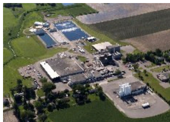
Aerial picture of the plant