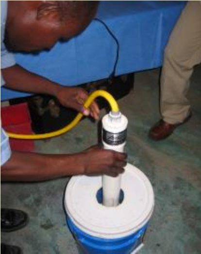
Local manufacturing of sodium hypochlorite solution in Haiti

The Safe Water System has been implemented in over 35 countries