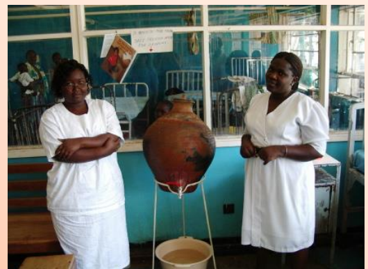
Nurses using the SWS in a hospital ward

The SWS and chlorination are most appropriate in areas with a consistent supply chain for hypochlorite solution with relatively lower turbidity water, and in urban, rural, and emergency situations where educational messages can reach users to encourage correct and consistent use of the hypochlorite solution.