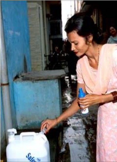
Woman in Delhi using the SWS

Studies have shown that household water treatment and safe storage interventions improve water quality and reduce diarrheal disease incidence in developing countries. Five of these proven options – chlorination, solar disinfection, ceramic filtration, slow sand filtration, and flocculation/disinfection – are widely implemented in developing countries. The decision of selecting which options are most appropriate for a community is often difficult, depending on existing water and sanitation conditions, cultural acceptability, implementation feasibility, availability of technology, and other local conditions. This series of technical bulletins is designed to assist organizations in comparing and selecting the most appropriate options.