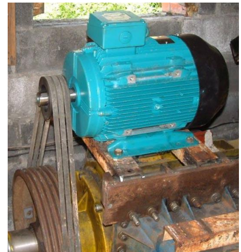
Generator installed to a gearbox turned by the wheel above rotating at 5 rotations per minute

Hydro equipment is relatively uncomplicated and needs simple routine maintenance. With a small effort on a regular basis this machinery can last, literally, for a lifetime.